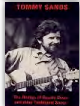
Hedges of County Down: And other traditional songs