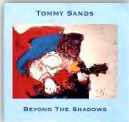
Beyond the Shadows