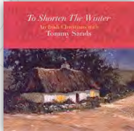
To Shorten the Winter: An Irish Christmas with Tommy Sands